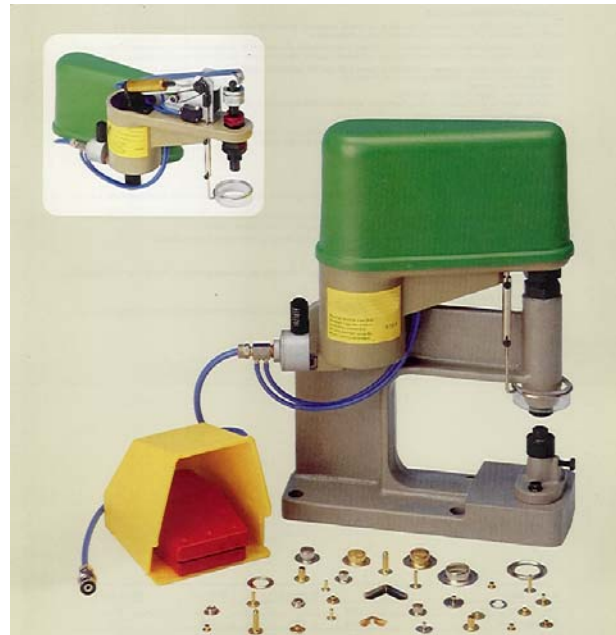
Table Cod. 80090200 Spot light point Cod.80165UP0V Support plate, Cod.80220000T